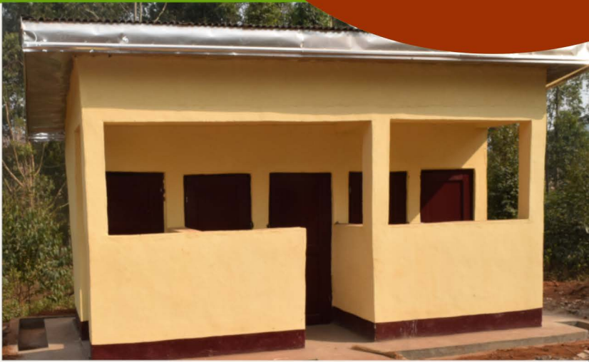
School toilet model constructed by Nascent for MGD 2015-18

2 out of 7 people in Central Africa practice open defecation. Close to 8.9 million people in Cameroon lacked access to improved sanitation such as a pit latrine with a slab in 2006. Lack of access to sanitary toilets, basic hygiene and sanitation education and clean water facilities contribute to the more than 315,000 yearly child deaths from diseases caused by unsafe water and poor sanitation in Africa. School absenteeism from these causes is high.